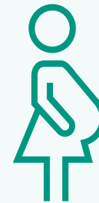
Mother to Baby During Pregnancy, Birth, or Breastfeeding