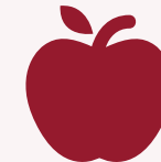
Sharing Food, Drinks