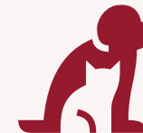
Pets or Insects