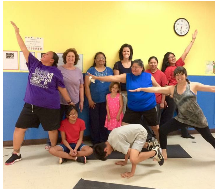
Yoga is a popular intergenerational GHWIC program at Alabama Coushatta.

Thanks to GHWIC, the Alabama Coushatta Tribal Nation of Texas (ACOT) was able to complete its first community health assessment (CHA) in nearly three decades. With the support of GHWIC and community input, ACOT was able to address many of the health needs identified from the CHA. However, many of the needs identified in the CHA required behavioral health support and prevention programming, priorities not directly addressed by GHWIC. So, while implementing various physical activity programs such as stick ball or chair yoga, creating a community garden, installing safe drinking water sources and working to update related health policies, ACOT and USET utilized CHA and program results to identify and apply for supplemental funding opportunities to allow ACOT to address needs for both behavioral and chronic health. As a result, ACOT has been awarded two additional grants through SAMHSA totaling nearly $1.3 million a year to support chronic health programming needs and expand to address CHA identified behavioral health needs. But ACOT is not alone. All nine USET GHWIC Tribal Partners have utilized their program successes to apply for additional funding opportunities, with at least four Tribal Partners having been awarded additional funds.