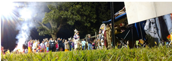
Cultural activities such as powwow dances and practices have been integrated into GHWIC programs.

More than 62 health promotion and disease prevention programs focusing on GHWIC priority areas have been implemented or planned at participating Tribal Nations. These programs provide needed services impacting more than 14,000 community members directly and have been a success because the community was engaged throughout the program planning process.