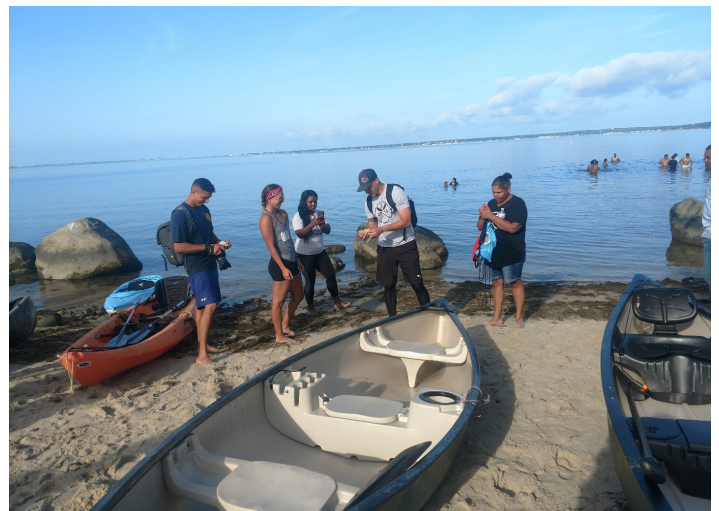
Traditional activities like canoeing have helped restore community connections to healthy living and the environment.

Four years of GHWIC activities and evaluations have provided a robust selection of community health and program data for all nine Tribal Partners participating in GHWIC, allowing them to pursue additional funding sources. To date, all nine Tribal Partners have applied for additional funding sources. Collectively, these Tribal Partners have been awarded at least eight additional funding opportunities totaling more than $7 million to grow or support their current GHWIC health promotion and disease prevention programming.